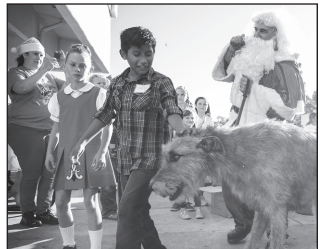
Great excitement as Santa O' Claus and his loyal companion Edward the Irish Wolfhound make their way through the crowd.

The Irish You a Merry Christmas San Diego organizing committee would like to thank the following businesses for their support: