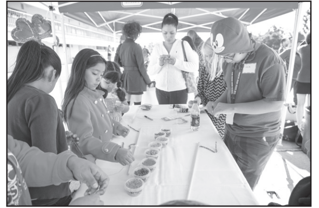
Guests enjoy the arts and crafts tent